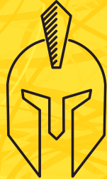
HELMET OF SALVATION