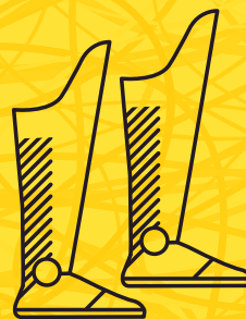
BOOTS OF PEACE