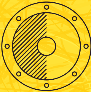
SHIELD OF FAITH