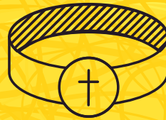
BELT OF TRUTH