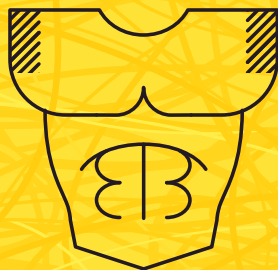
BREASTPLATE OF RIGHTEOUSNESS